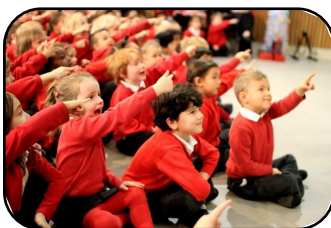
The children enjoying the whole school pantomime