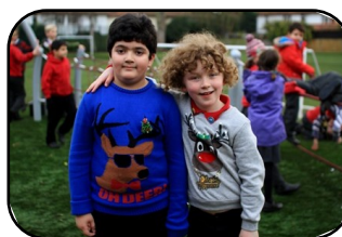
We raised over £150 for charity New-life with our Christmas jumper day

We've had lots of different events going on around school as we build up to Christmas. Thank you for always supporting our school events so whole heartedly. We'd like to invite you all to our annual Christmas service at Holy Trinity church on Thursday at 10am. It should be a lovely occasion.